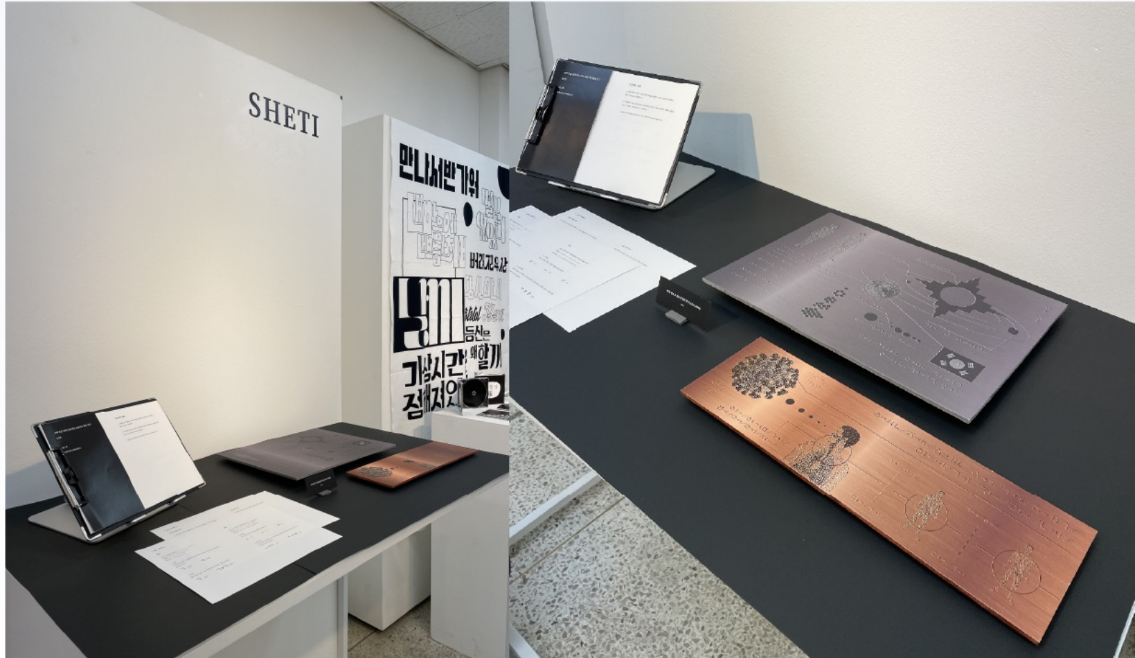
I displayed them in the exhibition at the end of the semester